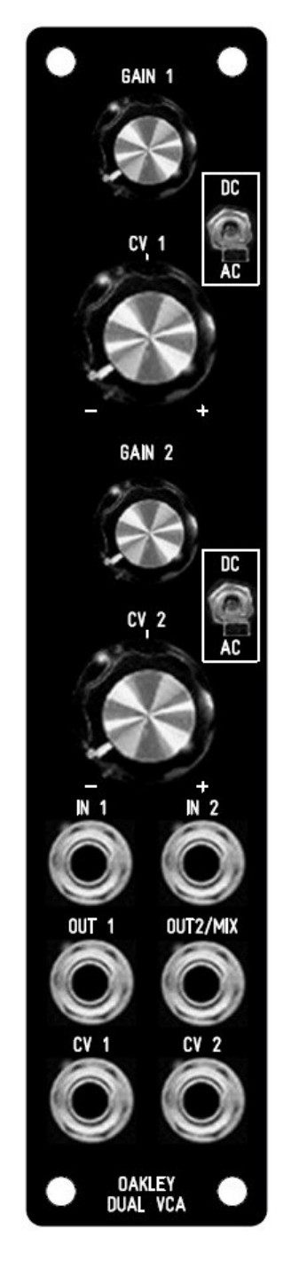
The suggested panel layout for the single width MOTM format module.