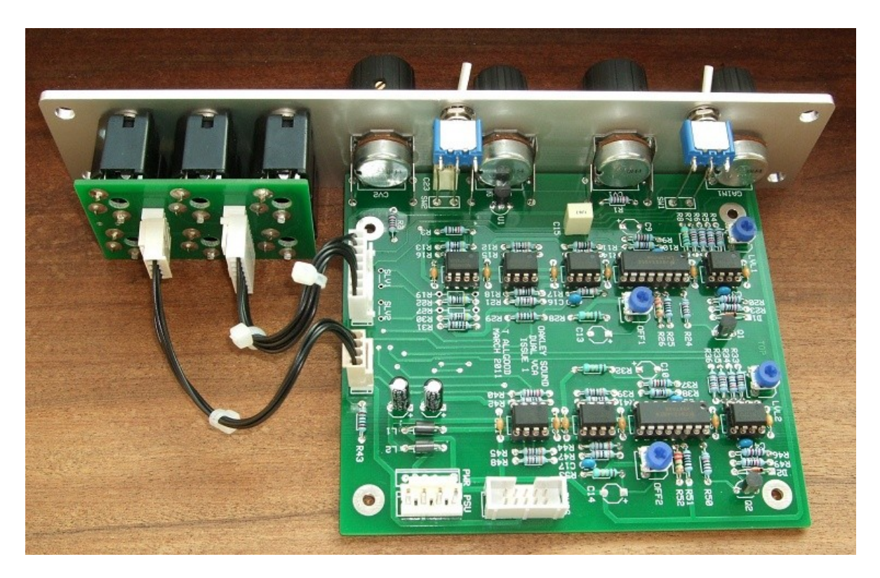
This is the original issue 1 Oakley Dual VCA module behind a natural finish 1U wide Schaeffer panel.

The Oakley Dual and Quad Voltage Controlled Amplifiers