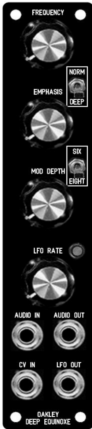
The 1U wide panel design for the standard Deep Equinoxe for MOTM format systems.