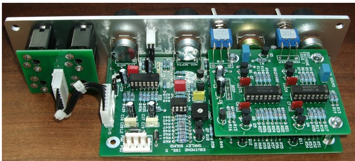
This is the issue 1 Oakley Deep Equinoxe module behind a natural finish Schaeffer panel. The actual Deep Equinoxe board is the smaller one mounted above the standard Equinoxe PCB.

For general information on how to build our modules, including circuit board population, mounting front panel components and making up board interconnects please see our generic Construction Guide at the project webpage or http://www.oakleysound.com/construct.pdf .