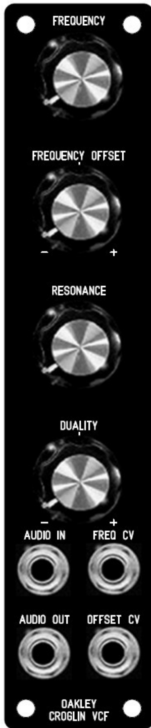
The suggested panel layout for the single width MOTM format module.