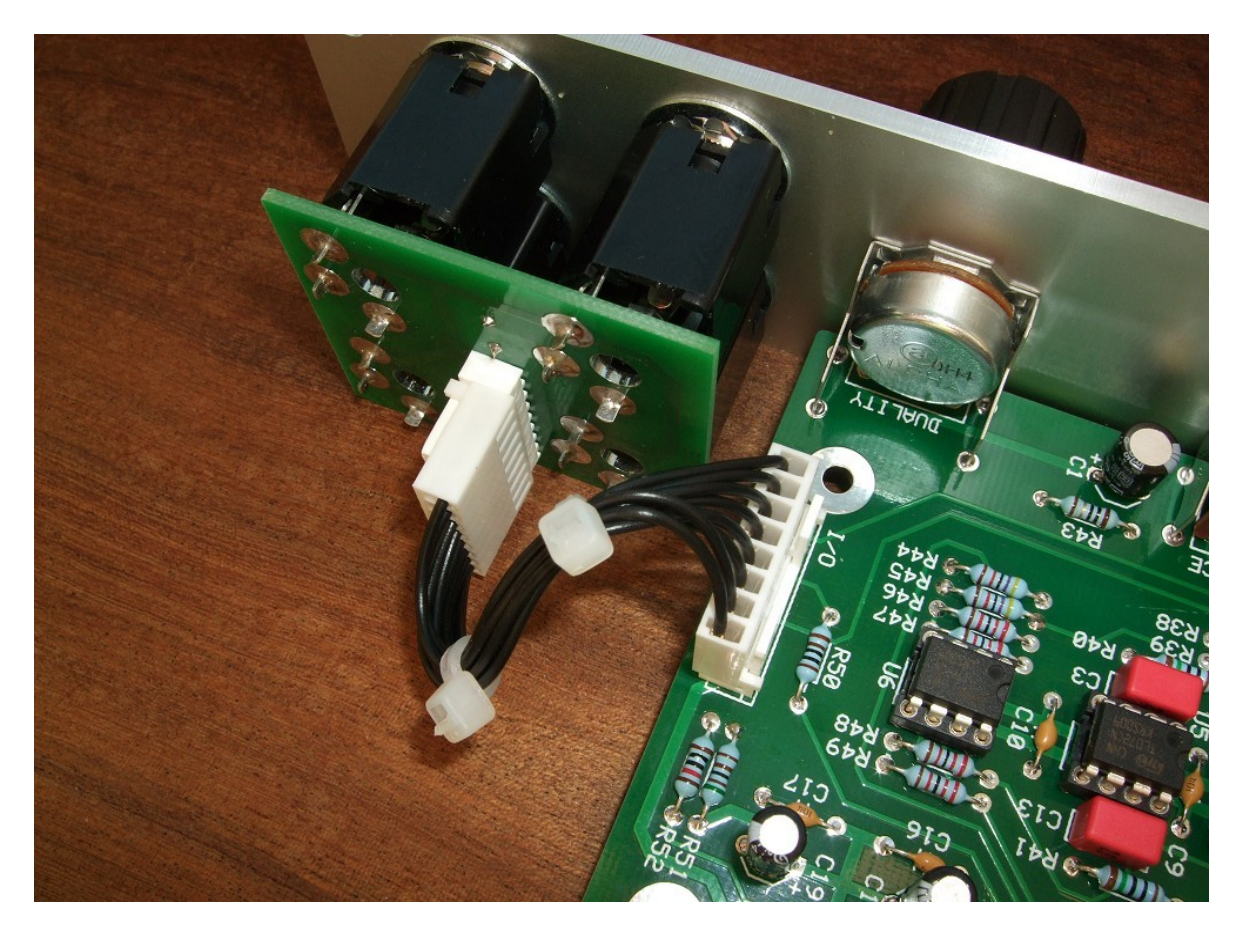
The prototype Croglin filter core module showing the detail of the board to board interconnect. Here I have used the Molex KK 0.1" system to connect the Sock4 to the main PCB.

You need to make up only one eight way interconnect. It should be made so that it is 100mm long.