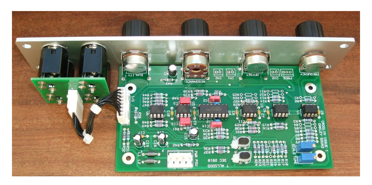
This is the earlier issue 1 Oakley Croglin VCF module behind a natural finish 1U wide Schaeffer panel. Note the use of the optional Sock4 socket board to facilitate the wiring up of the four sockets.

On the Croglin printed circuit board I have provided space for the four main control pots. If you use the specified 16mm Alpha pots and matching brackets, the PCB can be held very firmly to the panel without any additional mounting procedures. The pot spacing is 1.625" and is the same as the vertical spacing on the MOTM modular synthesiser and most of our other modules.